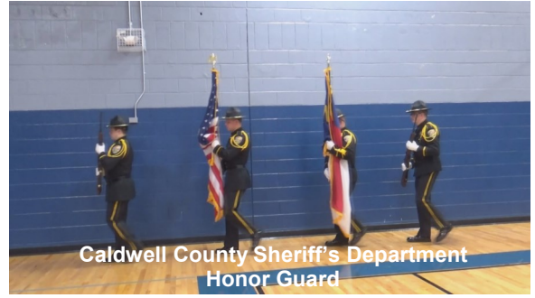
Caldwell County Sheriff's Department Honor Guard