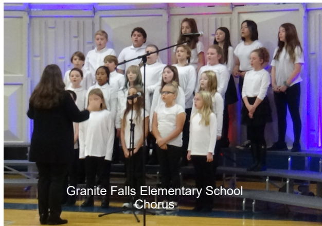
Granite Falls Elementary School Chorus