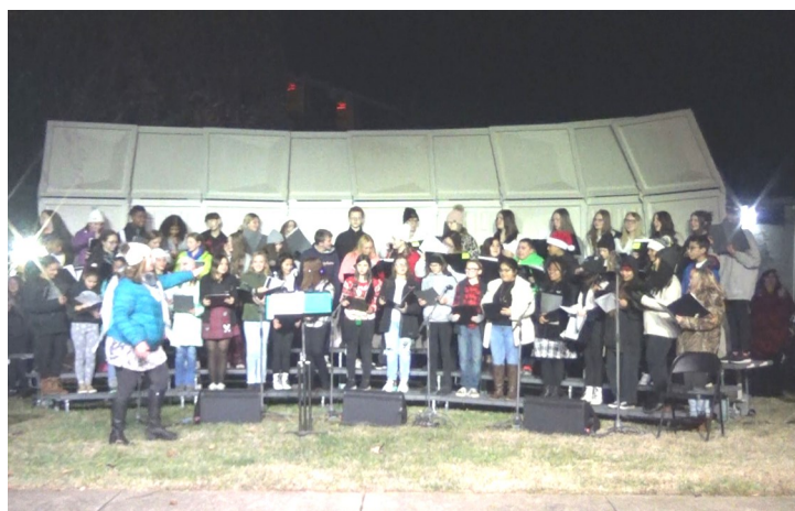
Above: Granite Falls Middle School Combined Chorus

(FESTIVAL ON THE SQUARE continued on page 4)