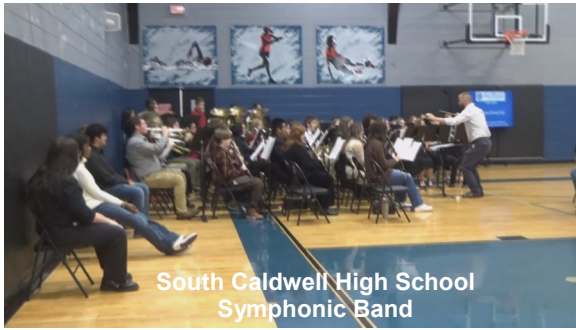
South Caldwell High School Symphonic Band