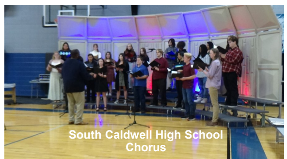
South Caldwell High School Chorus